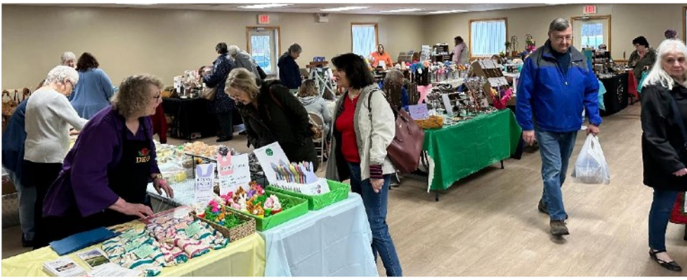
The March 23 DKG Craft/Bake Sale was a success!