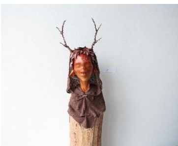
La Figlia , 12 December 2019, 19" x 10" x 7 ½",