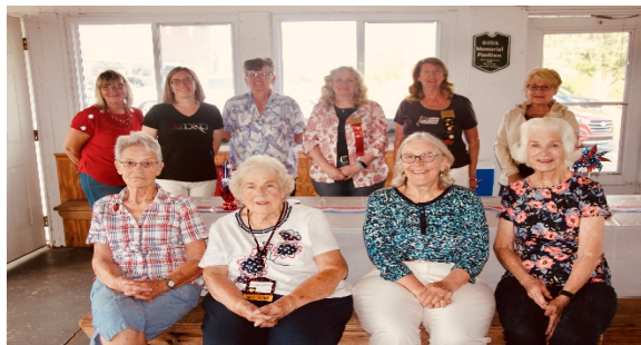
June 14 th Combined Beta Kappa and Omega Patriotic-Themed Picnic