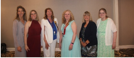
Beta Kappa Sisters following the Convention Dinner