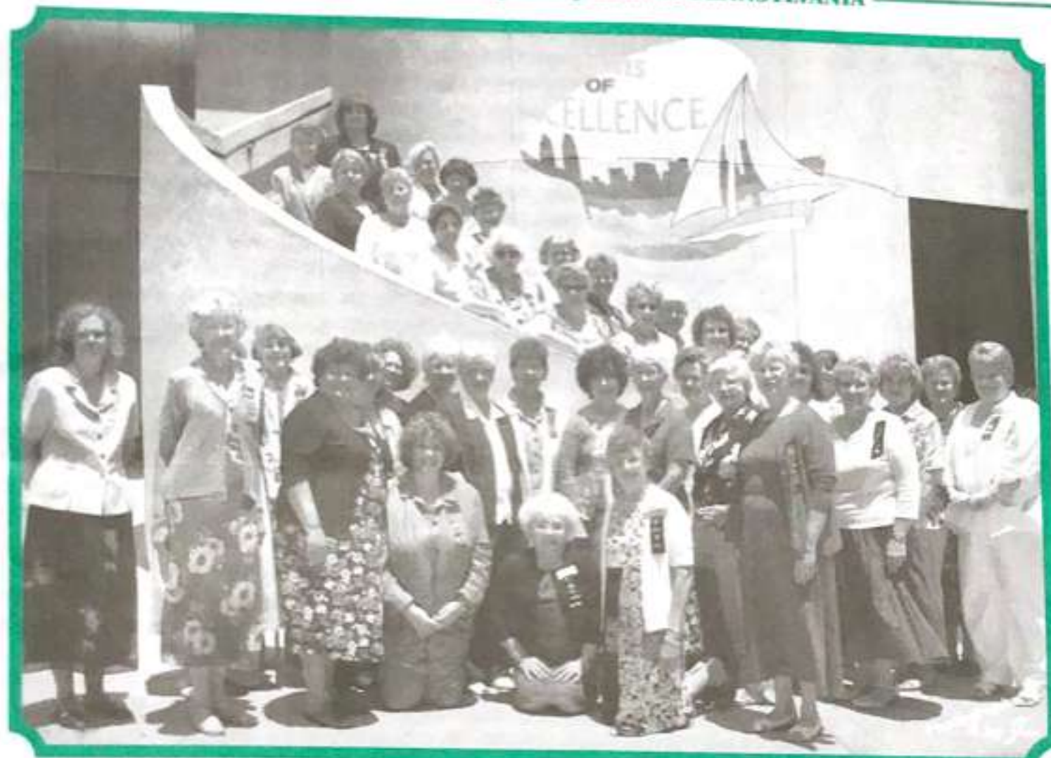
Pennsylvania's delegation to the International Convention in San Diego included six First Timers.