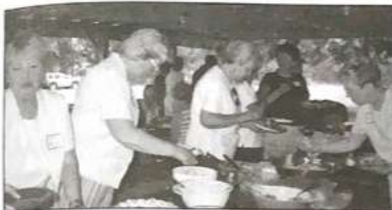
Members present enjoy a delicious dish-to-pass luncheon at the Northeast Area Meeting.