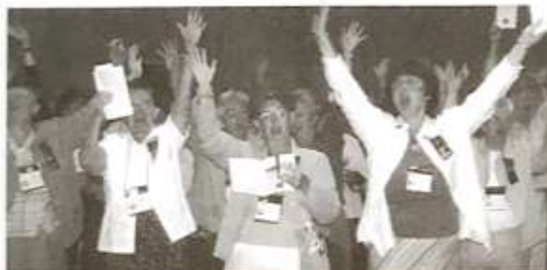
Pennsylvanians join the sing along