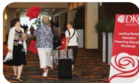
...taking my rose home...