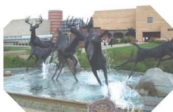
Museum fountain outside hotel