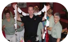
...just having fun...