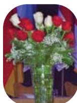
Celebration of Life Ceremony