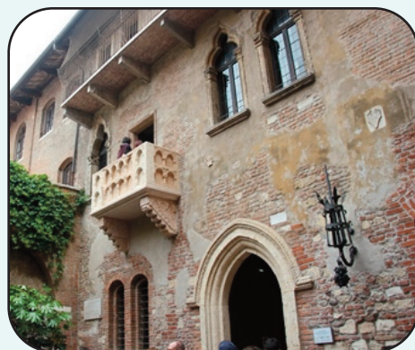
Romeo and Juliet Balcony

Verona, Italy (UNESCO site) is famous for being the setting of Shakespeare's “ Romeo and Juliet ,” a 14th century resi-