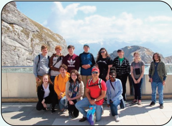
13 high school students on Mt. Pilates, Switzerland

car – mountain views span as far as 200 miles!