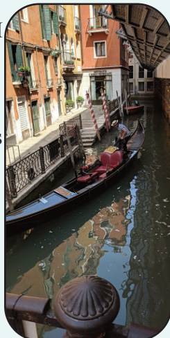
Venice Canal and Gondola

Day 5 - We departed Munich for Venice via Innsbruck, Austria. Of