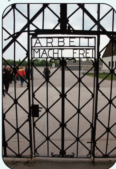
Dachau Gate translates to “Work Sets you free.”

Our next stop was Munich to experience a 3 hour guided bike tour, which showed us famous spots such as an English garden, Odeon's square, and of course, a typical German beer garden!