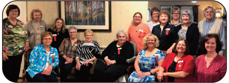
2018 Chapter Officers at York County Meeting