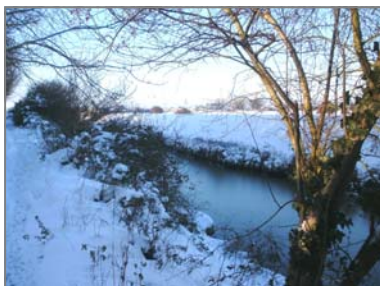
A Winter Scene

Down the village street towards the sea, St James cottages are on the left, named after the chapel which was there before, which in its turn was named after the chapel which stood in Chapel Field a mile north of the Star Inn. Now only fields, Northeye was a medieval village on an eye (island) in the middle of salt flats.