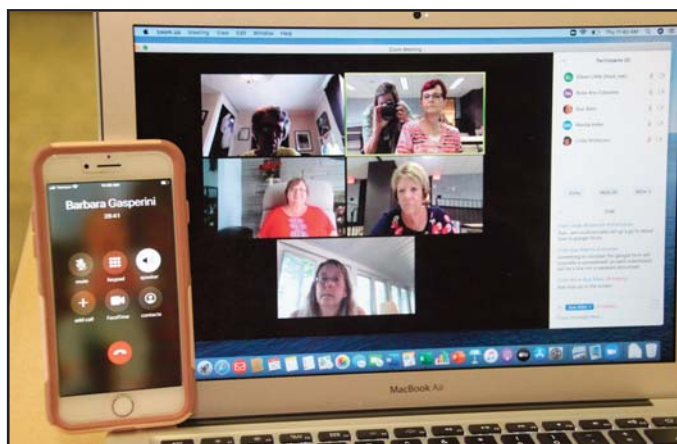
Zoom attendees were not required to wear masks or social distance.