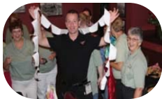
...just having fun...