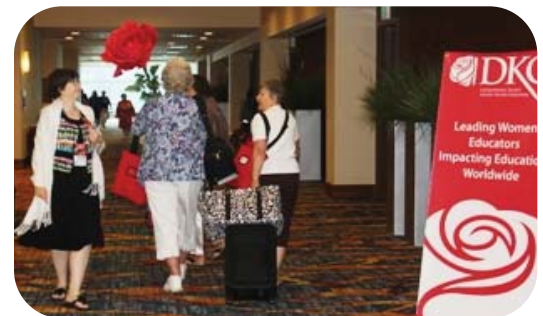
...taking my rose home...