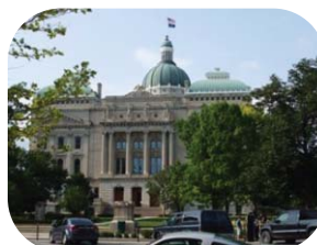
State Capitol Building