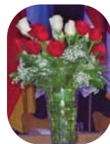
Celebration of Life Ceremony