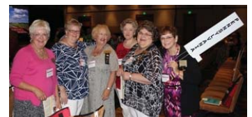
PA Session Seating