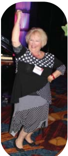
Indiana Night dancing