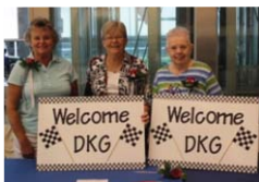
An Indiana Welcome