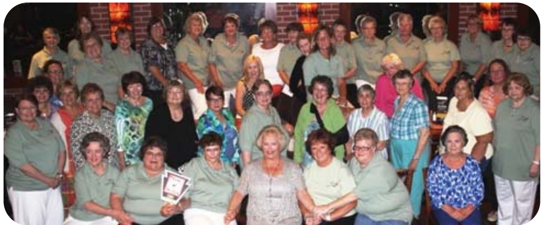
PA Night Group Photo