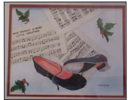
Things That Bring Me Joy