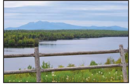
The Mountains are Calling