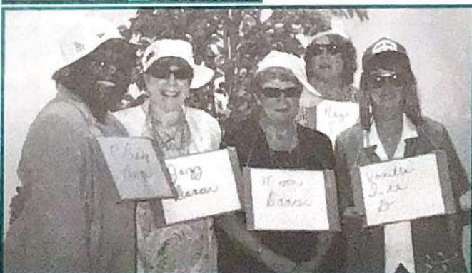
Alpha Lambda Chapter celebrated their 50th year in style and still in touch with the times! You go, girls!!!