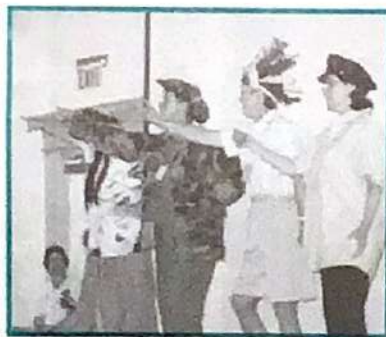
Alpha Theta entertains with their ΔKT version of "YMCA"