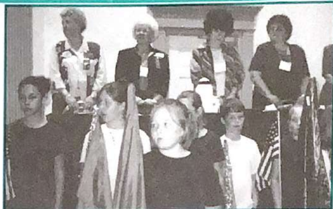
Northern Tioga County School children provided a rousing opening to the 2005 Alpha Alpha State Convention.