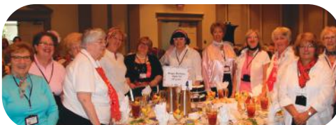
Alpha Xi 60