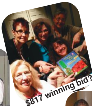
$817 winning bid?