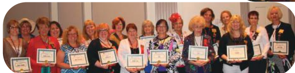
Chapter Newsletter Awardees