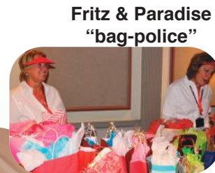
Fritz & Paradise "bag-police"