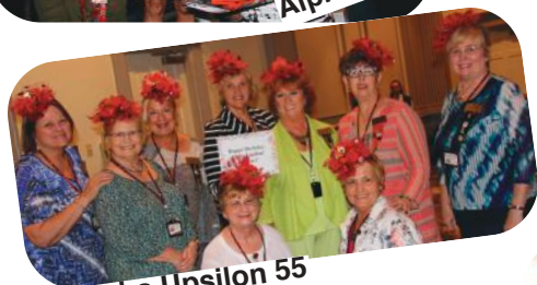
Alpha Upsilon 55