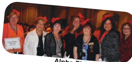
Alpha Phi 55