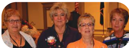
Alpha Omega 55