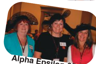
Alpha Epsilon 65