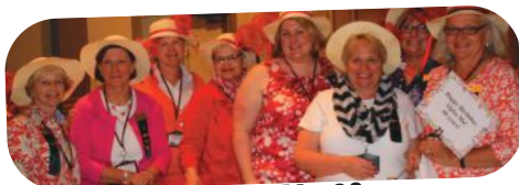
Alpha Mu 60