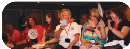
Casino Money Bidding Frenzy