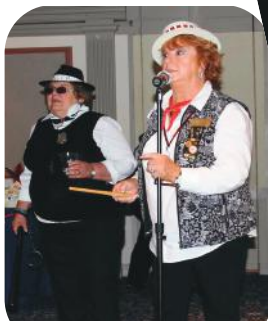
...the Blues Sisters?