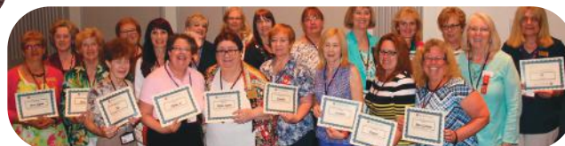
Chapter Website Awardees