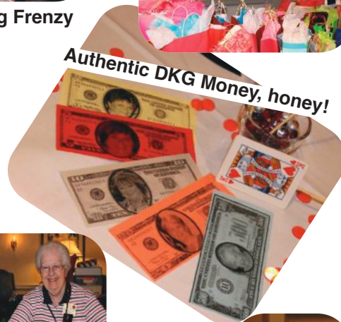
Authentic DKG Money, honey!