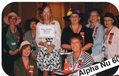
Alpha Nu 60