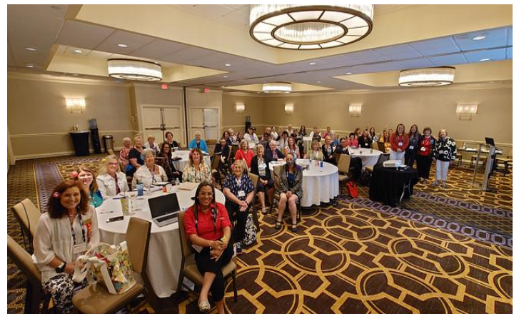
2023-2025 EEC State Organization Chairs attending training in Irving, Texas

In-person training June 23-25, provided an in-depth study of the focus areas of EEC. Plans were also developed to enhance relationships with the EEC chapter chairs or contacts in their state organizations.