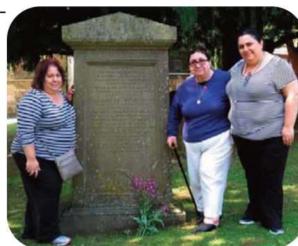
Henderson-Ramsay Tombstone Auchterderran, Scotland