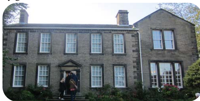
Parsonage in Haworth, England where Charlotte and Emily Bronte wrote their novels

Besides visiting York, the other highlights of the trip for me were Hill Top Cottage, home of Beatrix Potter, where she wrote and illustrated her famous children’s stories and the Bronte sisters’ home in Haworth where Jane Eyre and Wuthering Heights were written. Copies of all of their works came home with me to share with my grandchildren.