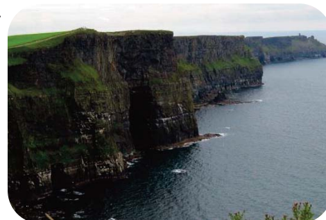
Cliffs of Moher, County Clare, Ireland