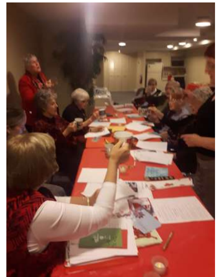
Eta Chapter celebrating Christmas and packaging items for the outreach program for Rotholme.