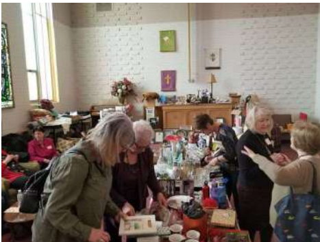
Members and guests examining the treasures to bid on.