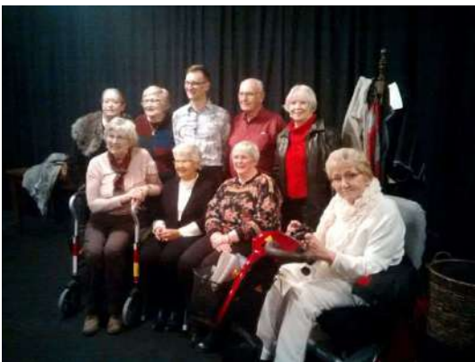
Eta Chapter members attend the opening of the play Harvest .